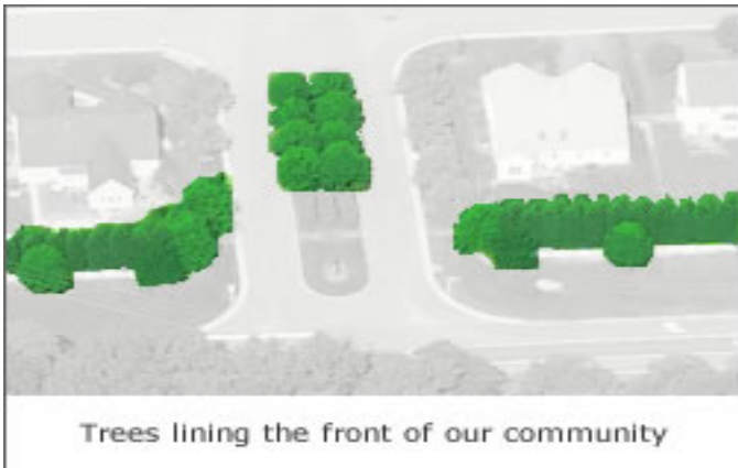
Trees lining the front of our community

You may be surprised, but we have hundreds of trees lining the several acres bordering the front of our community.